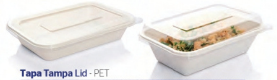
Tapa Tampa Lid - PET

950 ml 221.39 □ 109.122 PACK: 50 U CARTON / MINIM: 600 U 20.00€/100 U