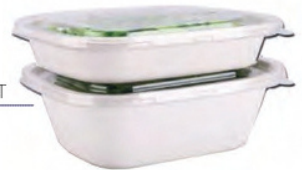
Tapa Tampa Lid - PET

1.800 ml 221.45 □ 109.132 PACK: 50 U CARTON / MINIM: 300 U 33.00€/100 U