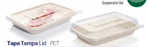
Tapa Tampa Lid - PET

221.40 109.211 18,8 x 12,8 x 0,9 cm PACK: 50 U CARTON / MINIM: 600 U 15.00€/100 U